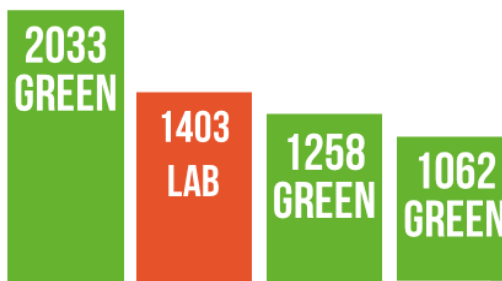
Dorset Council election results Rodwell & Wyke 2019: first 4 candidates