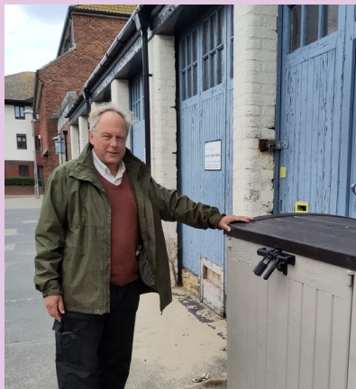
Queen Street flood store

Melcombe has many houses that are close to sea level. Flooding from the sea or river is a growing threat as global heating boosts the power of storms.