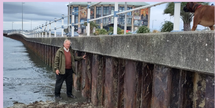
Where wall repairs are planned

has been an initiative to recruit flood wardens. These helpful locals will monitor weather warnings. They will then turn out to check on streets if the threat looks real. They link to the environment agency and local emergency services if needed. If you are interested in joining; contact the coastal forum ( or me).